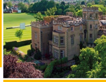
Regent's Park University

All Nations College, near Ware, Hertfordshire, is set in 12 acres of beautiful grounds and woodland. As well as full access to the grounds and football field, students enjoy a supervised camp fire and BBQ at this centre.